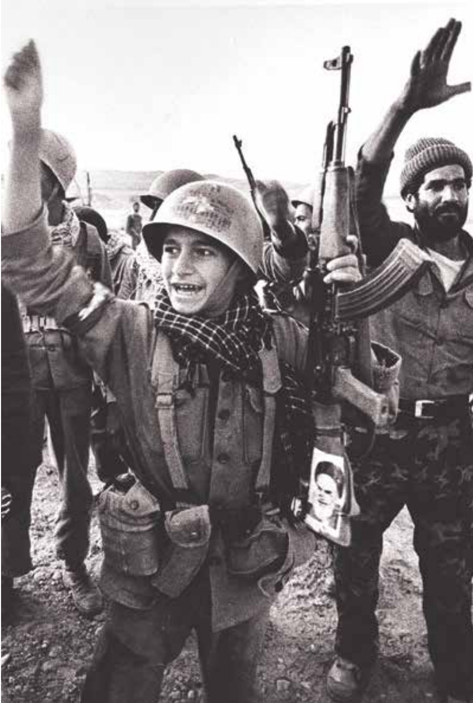
Iranian soldier during Iran-Iraq War.

Similar to PTSD and ASD, adjustment disorders require exposure to a stressful event, which results in clinically significant distress or impairment. However, in adjustment disorders, the stressor does not need to be “traumatic” (i.e., as severe as for ASD or PTSD). Further, adjustment disorder does not specify required symptoms and the patient’s condition should not be explained by another disorder.