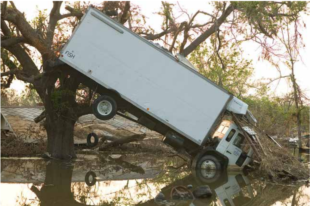
A freezer truck containing fish is left leaning against a tree in the front yard of a destroyed residence after Hurricane Katrina in Plaquemines Parish, Louisiana, US.

Although evidence-based treatment approaches including CBT adapted to culture-bound syndromes, eye movement desensitization and reprocessing (EMDR) and narrative exposure therapy are useful to alleviate PTSD symptoms among young refugees, a holistic approach is usually also necessary (Papadopoulos, 1999). Because they are under important social and material stress, young refugees frequently need to discuss current practical difficulties rather than past experiences. Finally, they may also wish to focus on the future rather than reflect on the past, and such a focus should not be discouraged (Beiser & Hyman, 1997).