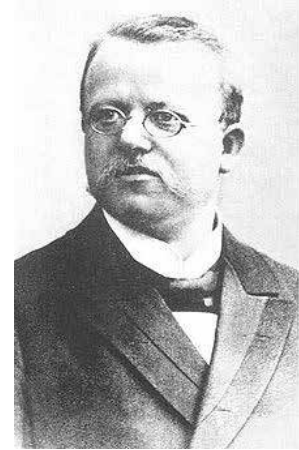
Hermann Oppenheim, a German neurologist, was the first to conceptualize psychological trauma in his 1891 treatise on “traumatic neuroses” ( Weitere Mitteilungen über die traumatischen Neurosen ) based on clinical observations of railway, factory, and construction accident victims.

In this chapter we will review the different types of psychopathological reactions specific to trauma. However, children and adolescents may develop other psychiatric conditions after trauma exposure including depression, panic disorder, specific phobias (distinctively related to some aspect of the trauma), as well as behavioral and attentional problems (e.g., oppositional defiant disorder). Among preschoolers, other clinical presentations include developmental problems such as loss of previously mastered skills (regression), as well as the onset of fears not specifically associated with aspects of the trauma. Of significance in DSM-5 is the addition of the developmentally modified PTSD subcategory of posttraumatic stress disorder for children 6 years and younger , which differs in important ways from the PTSD criteria for children older than 6 years. Especially significant for the diagnosis of PTSD in children aged 6 years and younger is that instead of the 7 symptoms required in older children and adults, only 3 symptoms are required, one each from the “intrusion”, “avoidance or negative cognitions” or “arousal” group of symptoms (see Table F.4.1).