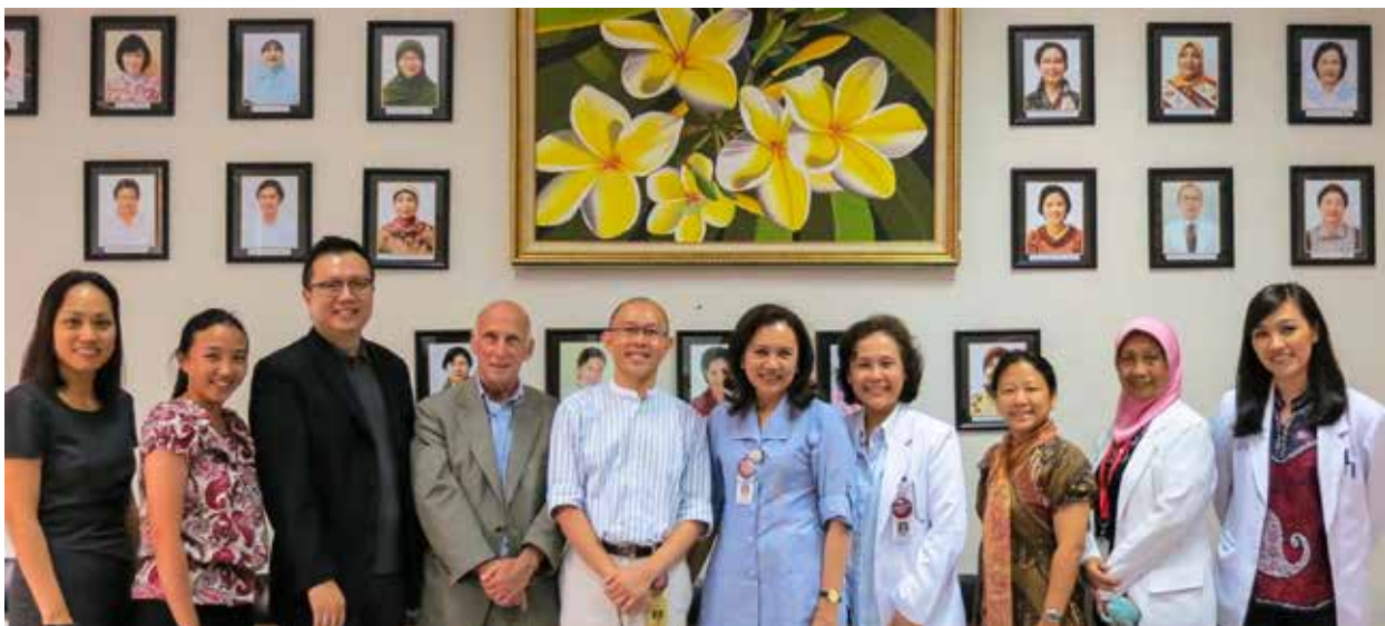
Participants in the 1st Steering Committee Meeting, Jakarta September 19, 2012 of the Asian Partnership to Support Mental Resilience During Crises.

ASD is therefore to be considered as a clinical entity that captures a significant level of distress and impairment, may help identify youth who might require clinical attention, and may be indicative of a possible subsequent PTSD.